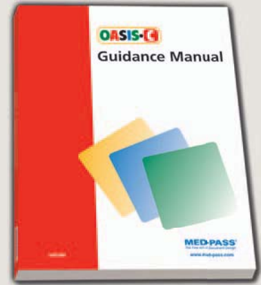
Actual Size: 8-1/2 x 11"

Help ensure the information your staff needs for a smooth transition to OASIS-C is readily available. This soft-bound manual assembles the multiple chapter and appendices files that make up the OASIS-C Guidance Manual on the CMS web site into one comprehensive, user-friendly reference resource that is ideal for use by the entire agency staff.